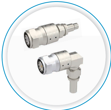
TNC Self-Lock TNC 18 Self-Lock