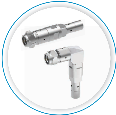
SMA 2.9 Self-Lock