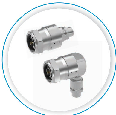
N 18 Self-Lock

As a leader in civil aircraft interconnection and RF connectors, Radiall introduces a new innovative technology in response to market demands to eliminate locking wires. Radiall's Self-Lock RF connectors are the perfect solution to provide secure connection-facing vibrations experienced in aerospace applications.