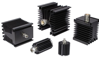
Microwave global range

Synergy is renewing its range of High Power Terminations from 30 to 200 Watts, available with Type N, SMA, 7-16 and TNC connections. This comprehensive offer ensures outstanding performance and quality, at a competitive price.