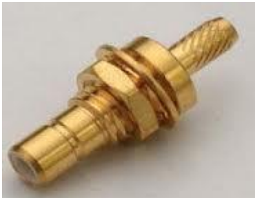
Straight Bulkhead Cable Plug, M06